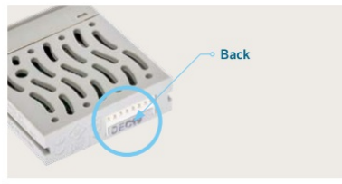
WAND Wi-Fi Modules

Date code is located under the wiring terminal strip. (mo/yr)